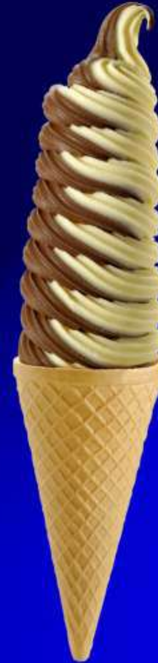
CREAM/COCOA HARD ICE CREAM