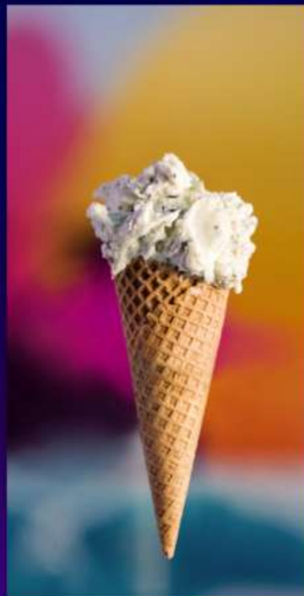
STRACIETELLA WITH MINT