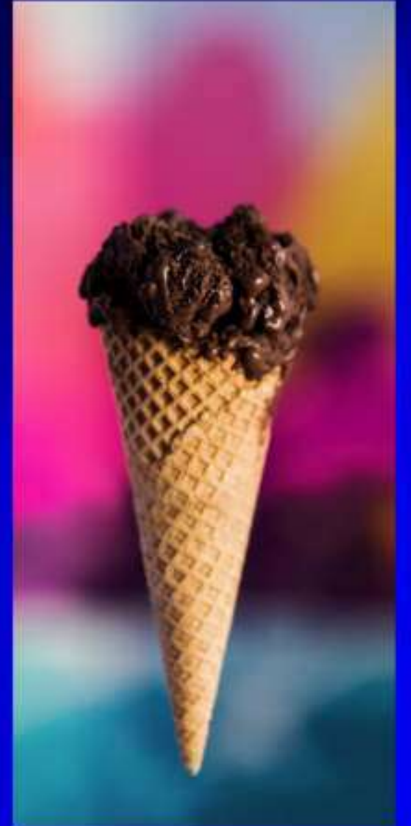
CHOCOLATE WITH CALIFORNIA PLUM