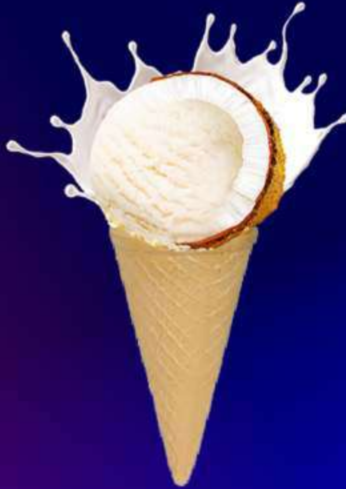
NATURAL HANDMADE SCOOP ICE CREAM