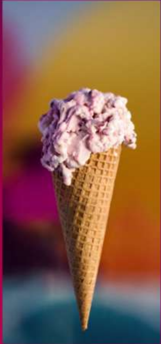
YOGHURT WITH BLACKCURRANT