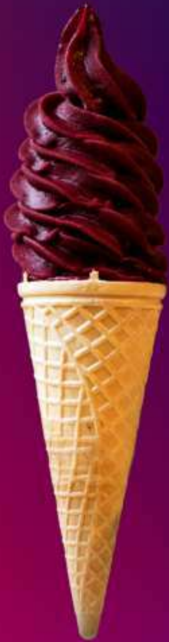
NATURAL SEMI-SOFT ICE CREAM