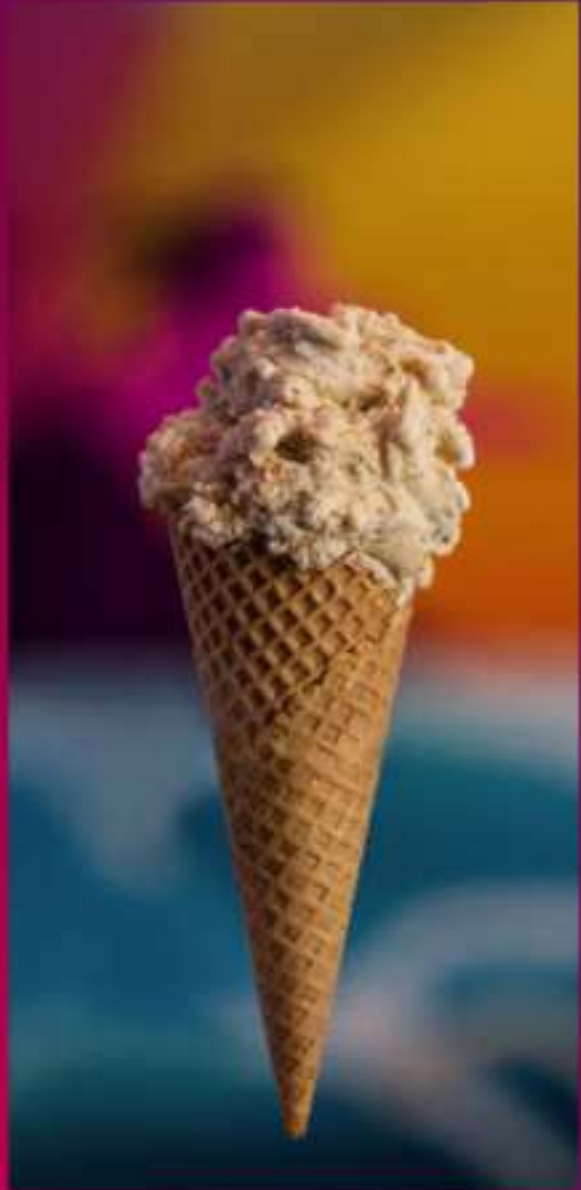
BANANA WITH DATES