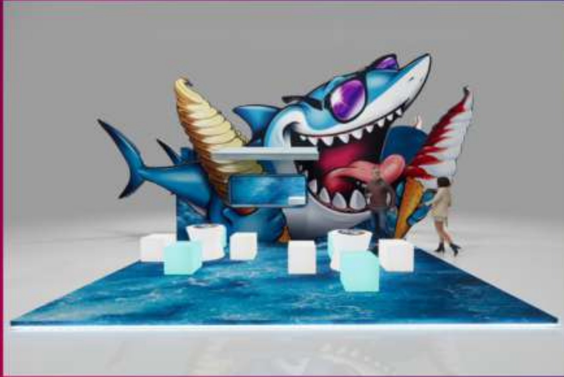
AIR-CONDITIONED OUTDOOR KIOSK 20 FT