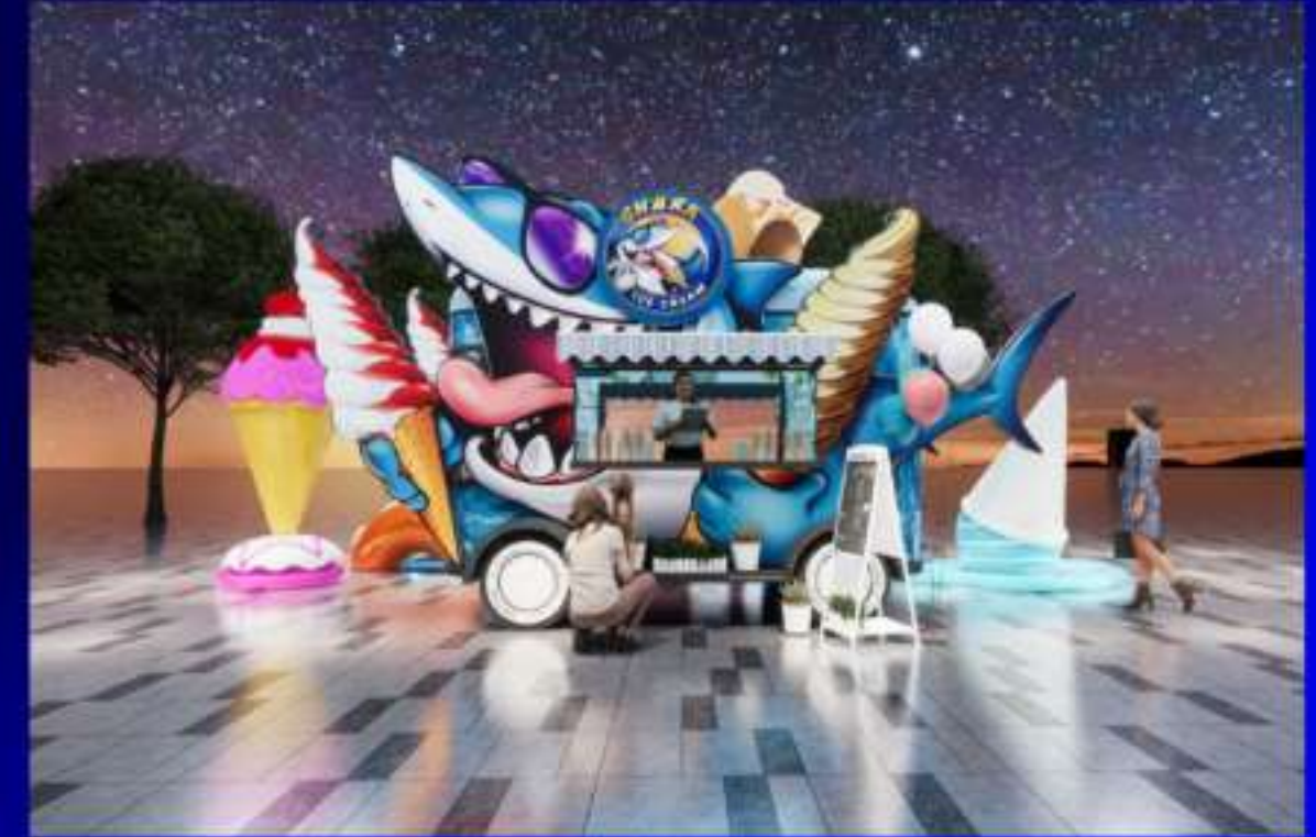
OUTDOOR KIOSK ON WHEELS

3 MORE PROJECTS COMING SOON IN JANUARY 2024