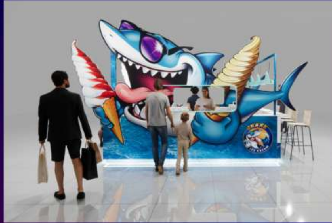
INDOOR KIOSK (FOR SHOPPING MALLS)