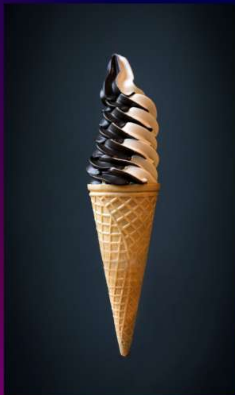
BLACK GOLD & CREAM