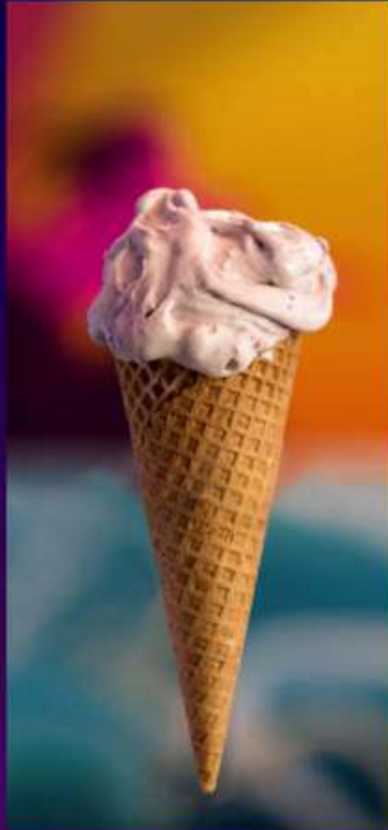
WHITE CHOCOLATE WITH BLUEBERRIES