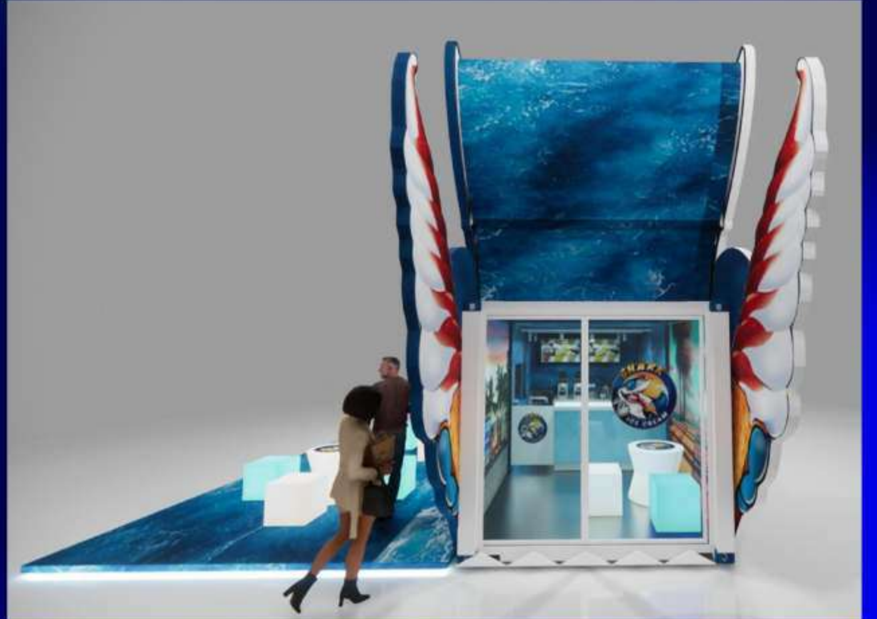
FRONT AND BACK VIEW OF THE KIOSK.